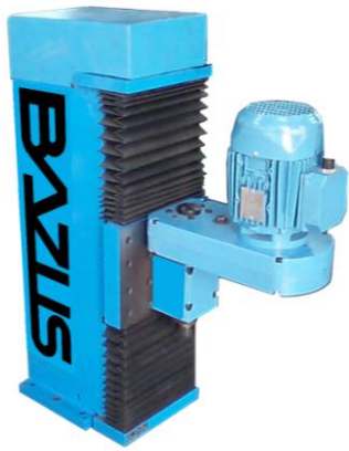
Vertical automatic unit (drilling)