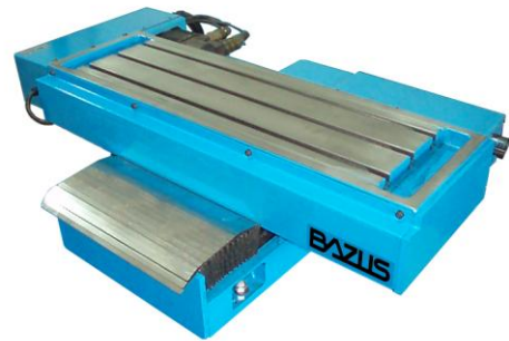
XY slide unit